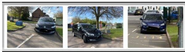
1 - Inconsiderate and dangerous

However, the actions of a few are causing tensions in our community and I am imploring everyone to consider our neighbours. I have had a flood of concerns and complaints particularly from the residents in the streets surrounding Knights Templars Way; dangerous driving and inconsiderate parking; children running on driveways and across gardens unchallenged by parents; discarded rubbish and cigarette ends piling up by the gate. I am Templars' biggest champion, but this is indefensible and embarrassing. I must remind you that it is a pedestrian and cycle zone only and the council can fine £60 for parking without a permit. I am being asked by the local council and the police to consider closing this gate permanently - if behaviour of the few continues, this may be taken out of my hands.