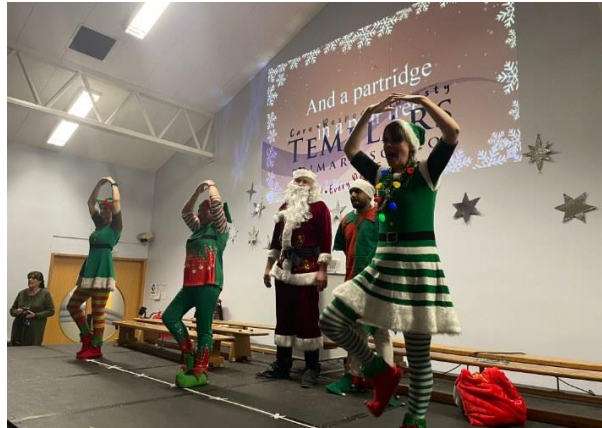
2 - The elves jumped off the shelf!