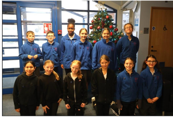
5 - Templars' JLT