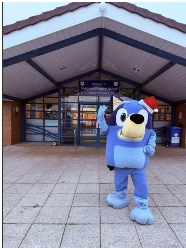
1 - Bluey surprised all at Supper with Santa!

Our first festive PTA event was Supper with Santa last Wednesday. A huge thank you to all helpers and especially our special guests from Amazon who provided the decorations for the event. Santa was particularly happy that he got to see many more children from Templars than normal and nobody had to queue!