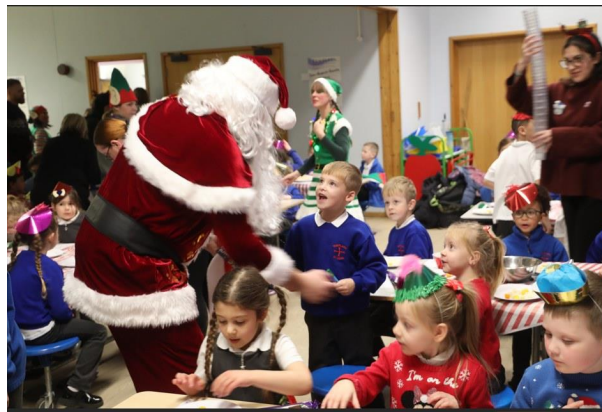
3 - Santa worked his magic