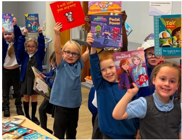
6 - A huge thank you to The Book Bank.

The kitchen cooked the best ever Christmas dinner for over 500 children and staff. Delicious - thank you so much to the kitchen and Lunchtime Supervisor Team.