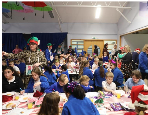
4 - Hundreds of children fed and entertained.

Thank you to the Junior Leadership Team who have made cards for our neighbours and supporters and helped organise the great 'Take a free book home for the holidays' idea. A very big thank you to the Coventry Book Bank who supplied the books. Every child in the school was able to choose and take home a quality book.