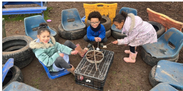
2 - Opal lunchtimes are the best!

If you have anyone in your family/friends who you think would be perfect for this, please ask them and let your class teacher know if they are happy to help.