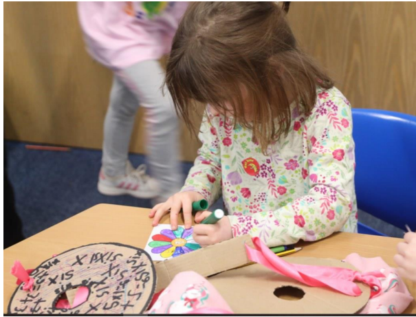
2 - Busy!