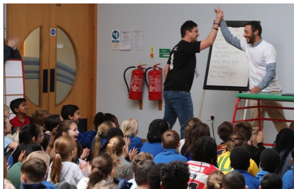
1 - Assembly fun

Even better, we have raised £320.80 for the NSPCC!