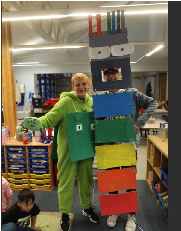
4 - Game for a laugh