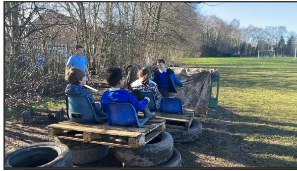
6 - Today's showing is The Dog Man movie!

Next week is Internet Safety Week. Children will be having lessons throughout the week and creating a question-and-answer e-safety page for the school website with each class answering a different question about internet safety. Staff will be having training on cyber security. Please make time for the online workshop shown here - the content is so important for keeping your children safe. Last week our PCSOs delivered assemblies to Year 5 and 6 - some of the answers given by our pupils, were worrying. The workshop is free, on at 12pm and 5.30pm but I believe recordable so if you sign up, you can watch in your own time.