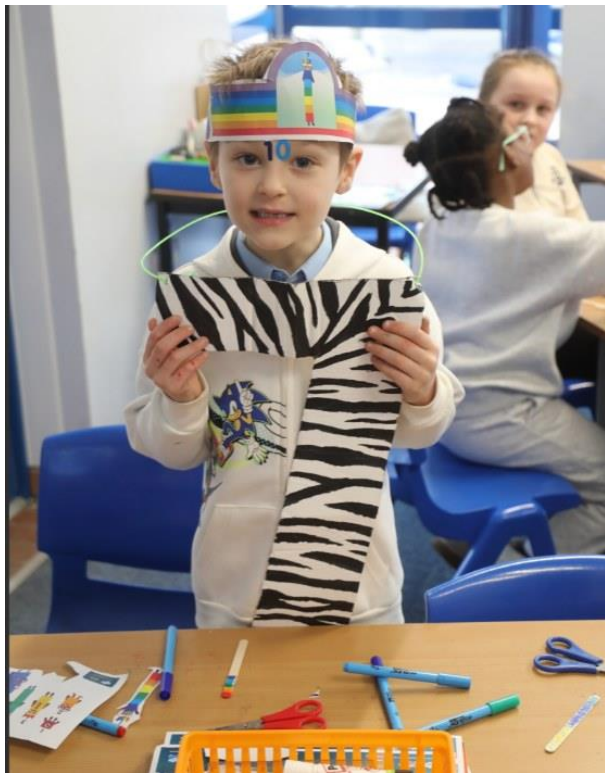
5 - Proud