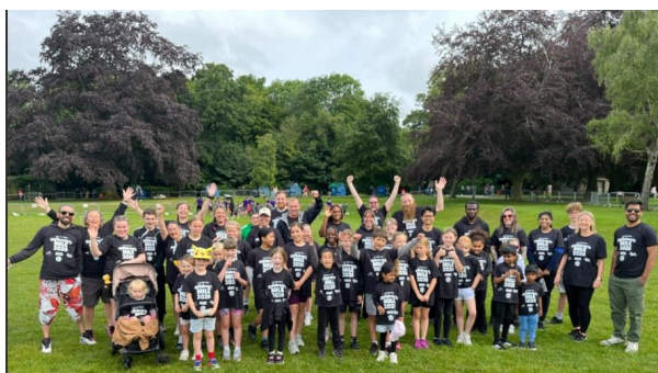
1 - Children's Mile heroes